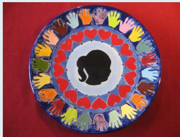
Division 1's Platter for the Starry Night Auction – "Head, Hands & Heart"